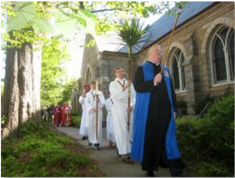
Verger and acolytes lead the Palm Sunday procession

There are many ways to serve God through Emmanuel using the time and talents with which you've been blessed. This list suggests some four dozen volunteer opportunities. If you're ready to step up or are merely curious, we'd like to talk with you. Please call the church office staff (706) 543-1294, visit our website, www.emmanuelathens.org , or get started with an email connection with the Vestry members and staff who are listed below.