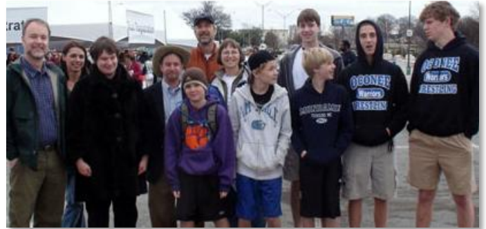
Emmanuel youth and adults join religious communities from all over Georgia on the Hunger Walk/Run for the Atlanta Community Food Bank