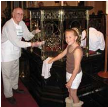
Granddaughter and grandfather enjoy shining the pulpit on clean-up day

Committees such as the Guild of St. Francis and other volunteers give oversight and ad hoc, hands-on support to caring for Emmanuel's campus facilities, landscaping and grounds, maintenance, and property management