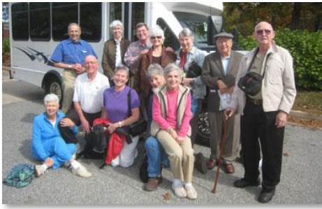
Super'Lites on their annual trek to supervise the changing of colors for North Georgia's fall foliage