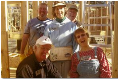
Emmanuel parishioners have helped fund and build two Habitat for Humanity homes in Athens

Northeast GA Food Bank Combats hunger in Northeast Georgia by acquiring and distributing food which would otherwise be wasted and increases awareness concerning the plight of those suffering the effects of hunger and poverty