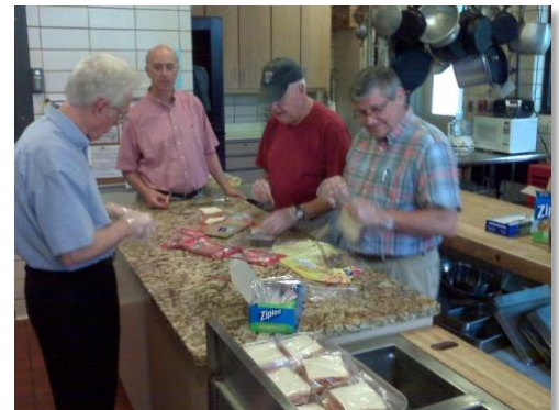
The Brotherhood of St. Andrew prepares 100 weekend sack meals for "Our Daily Bread" ministry in the Emmanuel kitchen

Emmanuel volunteers provide support services to ethnic Karen refugee families from Burma who've located to the Athens area to begin new lives