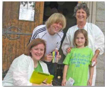
Vacation Bible School leaders join a happy student sporting her new t-shirt