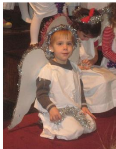
Angels are among us, and not just at Christmas