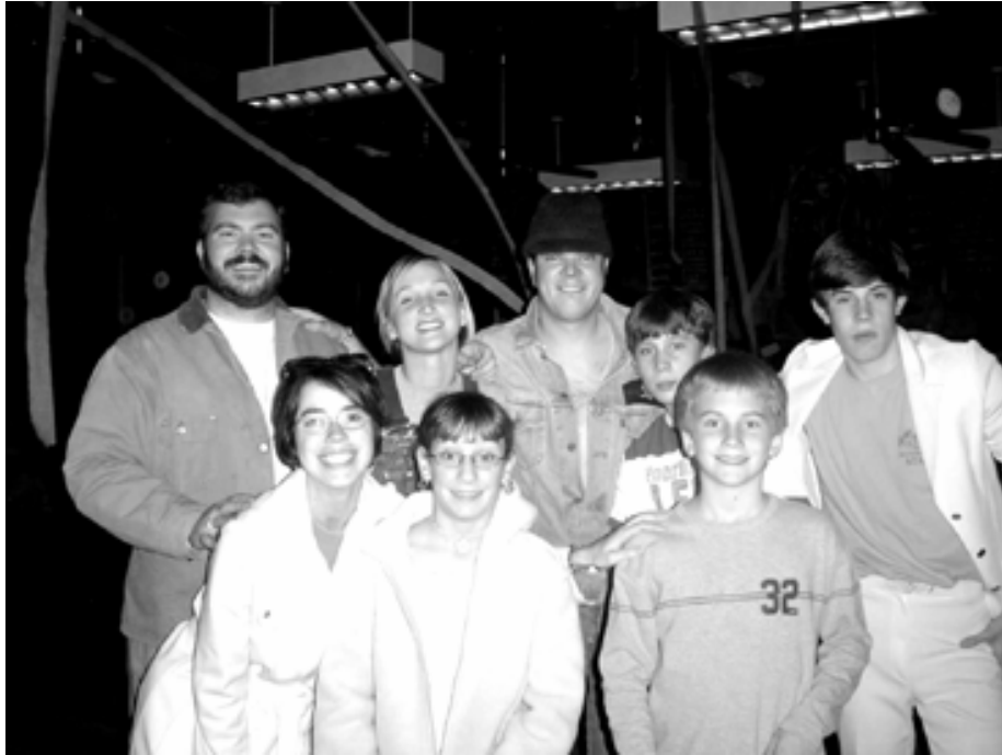
DYC participants from Emmanuel pose at the Disco Dance

(Jr. DYC is open to all 6 th -8 th graders & Sr. DYC to all 9 th -12 th graders). I am glad I got to go to the retreat, and I am glad to be an Episcopalian. We have lots of fun! There is an all Emmanuel EYC retreat coming up on January 28-30 and I think that anyone who can go should.